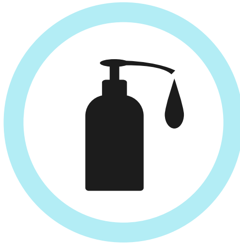
Use Soap or Hand Sanitizer