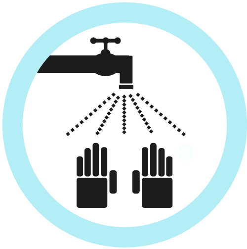
Wash Hands Thoroughly